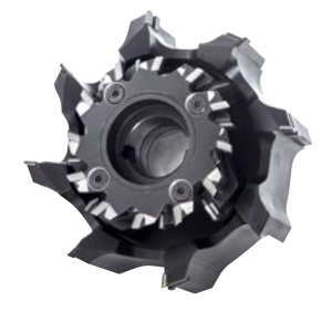
Mortise & Tenon Cutter

Our specially designed mortise & tenon cutter heads for optimal production of cabinet doors.